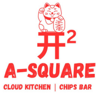
A SQUARE SNACK PARTNER