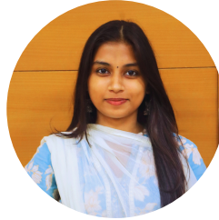
SHOBHNA KASHYAP ACTOR