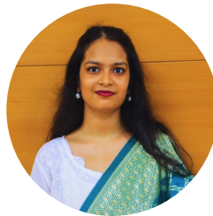
SHUBHANGI BHATTACHARYA ACTOR