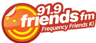
91.9 FRIENDS FM EXCLUSIVE RADIO PARTNER