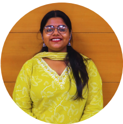
BRISHTI CHAKRABORTY ACTOR