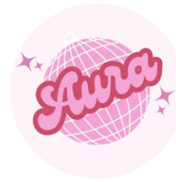
AURA GIFT PARTNER