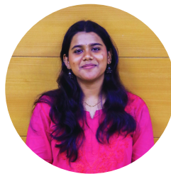
ATTUNE SALAM DANCER