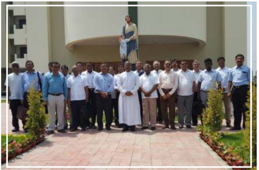
Members, Governing Board, St. Xavier's University, Kolkata 2017