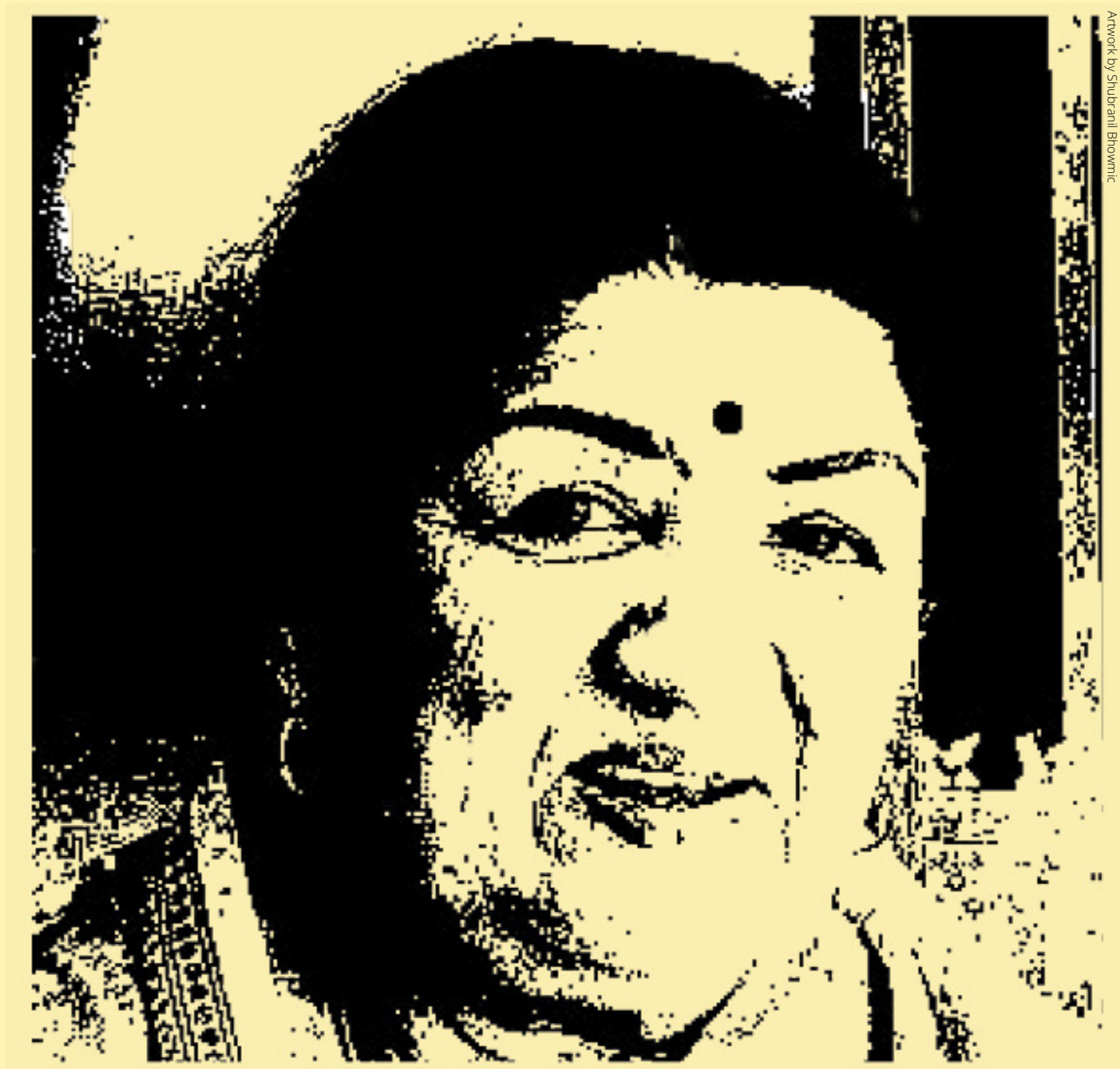
Artwork by Shubranil Bhownic