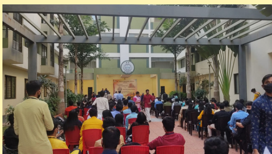
Students attending the program at the Quadrangle

"International Mother Language Day is a moment for all of us to raise the flag for the importance of mother tongue to all educational efforts, to enhance the quality of learning and to reach the unreached" said Irina Bokova ,the former Director General of UNESCO. This day is not just celebrated to emphasize on the importance of one's mother language but also to promote cultural and linguistic diversity in different regions. Therefore St Xavier's University just like always celebrated the day with full vigor and enthusiasm and also celebrated the World Day of Social Justice on February 21, 2022 from 4:15 to 5:00 PM in the Quadrangle. It was attended by all the faculty members, officers, non teaching staff and the students.