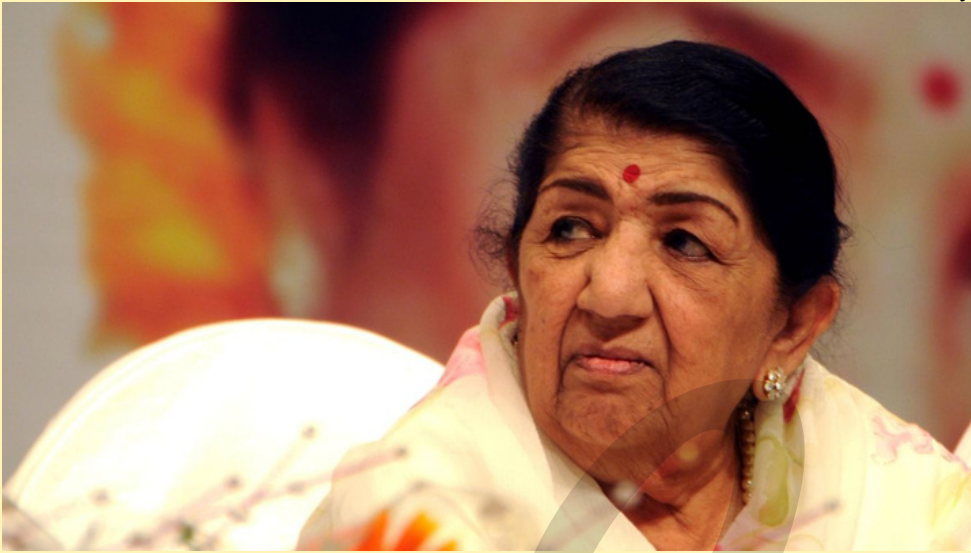
The late Singer in her old ages