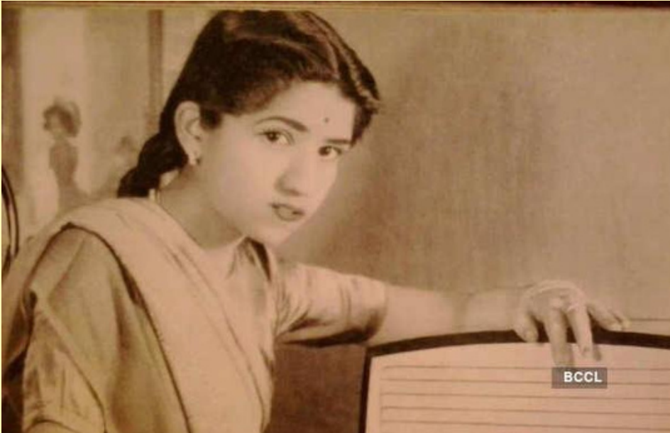
The late Singer Lata Mangeshkar In her teenage years