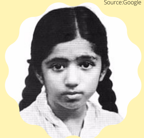
A Childhood picture Of Lata Mangeshkar