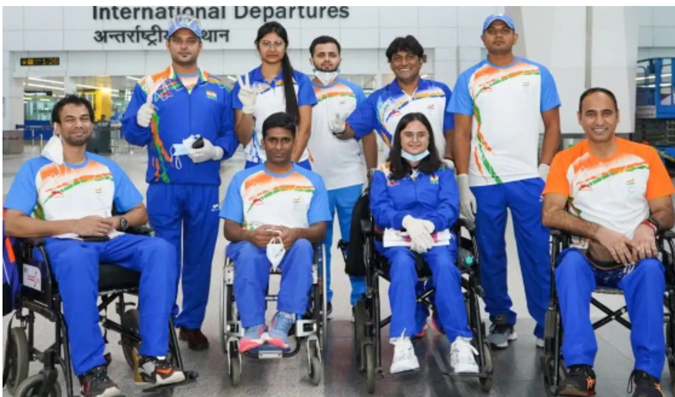
Paralympics participants representing India in Tokyo 2020