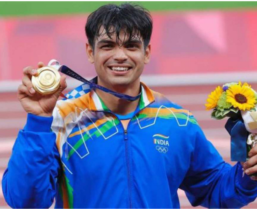
Neeraj Chopra

achieved at the 2018 Asian Games in Jakarta. India. Chopra's historic triumph in Tokyo with the aid of his German coach, Uwe Hohn, took years to achieve. Neeraj began throwing jav-