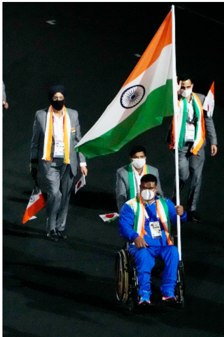
A still from Tokyo Paralympics 2020