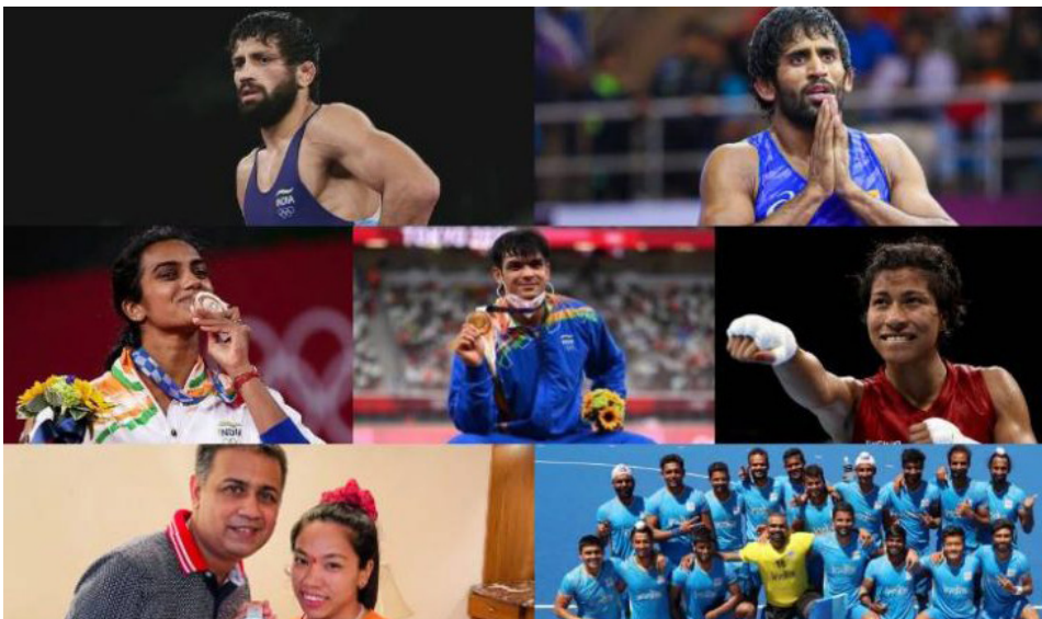
Tokyo Olympic Medalists from India